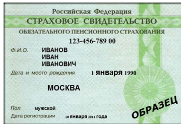
Sample of a SNILS card