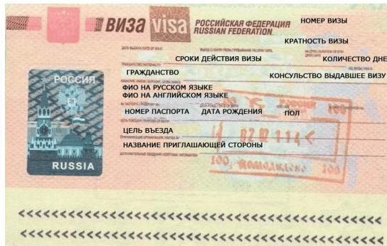
Sample of a Russian visa

An initial entry visa is issued by a Russian Federation consulate or visa centre in the student's primary country of residence and is valid for a single entry only. Such an entry visa is only valid for 90 days and requires extension – please check EXTENDING YOUR STAY IN RUSSIA section.